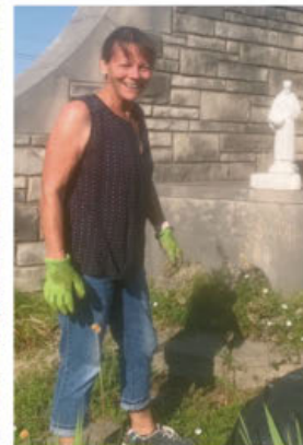
Just a few of the crew members from last week.