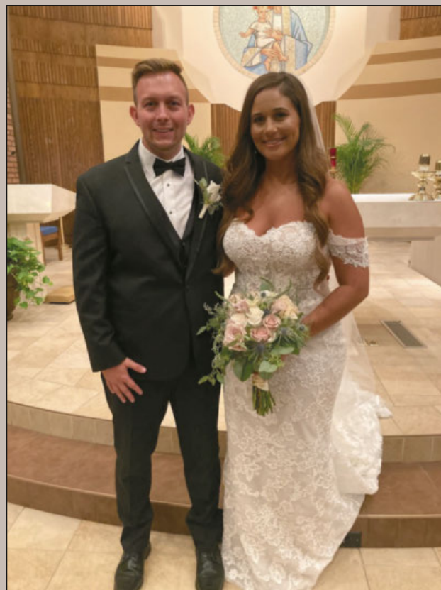
SACRAMENT OF MARRIAGE

Your generous support this past year helped us bring hope to over 1,000 at risk men, women, and children.