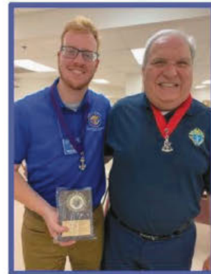
Meet Life Award