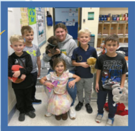
Some of our 1st Grade PSR students got a visit from the Queen's Derby pup, Jameson, before he went to his new home.