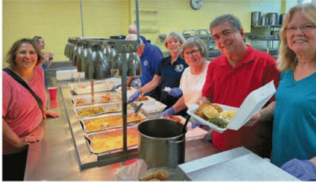
We served QAS Picnic dinners (sold out!) in the comfortable school cafeteria.

Thank you for the support you give our Neighbors In Need! God bless you!