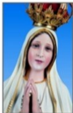
Our Lady of Fatima