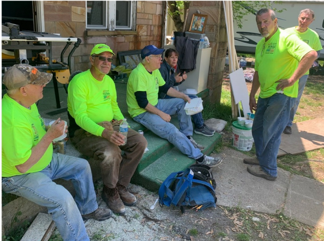
Small part of the crew of 20 men and 5 women, taking a well deserved break.

The crew is headed back to flood ravaged Waverly, TN. August 2021, the town was devastated by a horrific flood that left 20 fatalities, including five children.