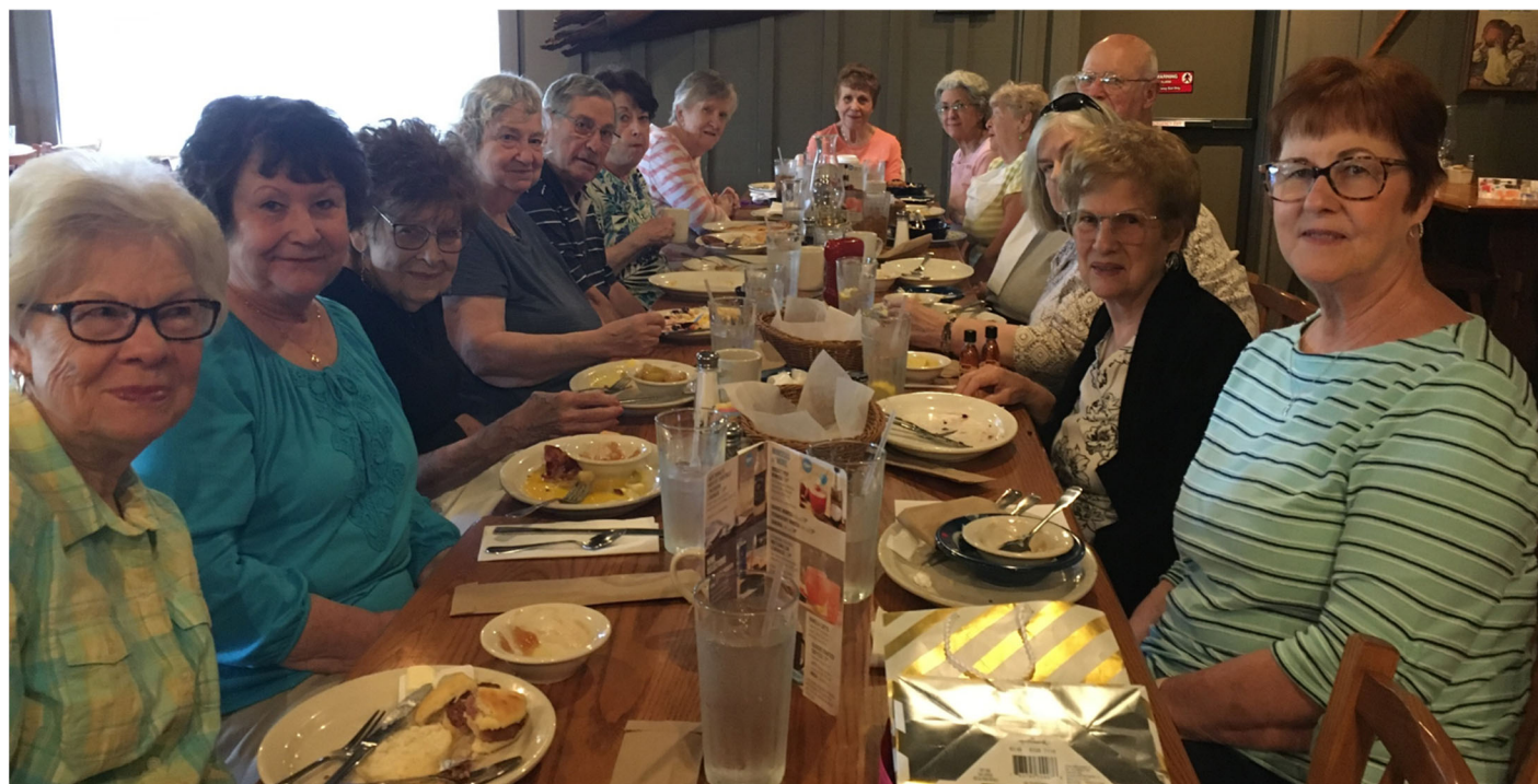
W.I.N.G.S. Breakfast outing in June was enjoyed by all who attended. Don't miss our next event!

All widows & widowers: Join us at the ELK's Club for their great chicken buffet dinner on Friday, July 22 at 5:00 p.m.