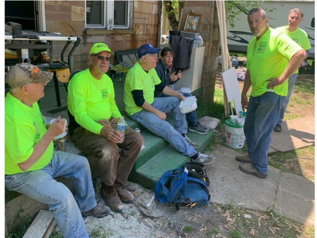
Small part of the crew of 20 men and 5 women, taking a well deserved break.

The crew is headed back to flood ravaged Waverly, TN. August 2021, the town was devastated by a horrific flood that left 20 fatalities, including five children.